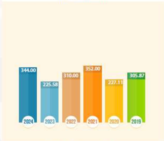
Market value per share (Rupees)