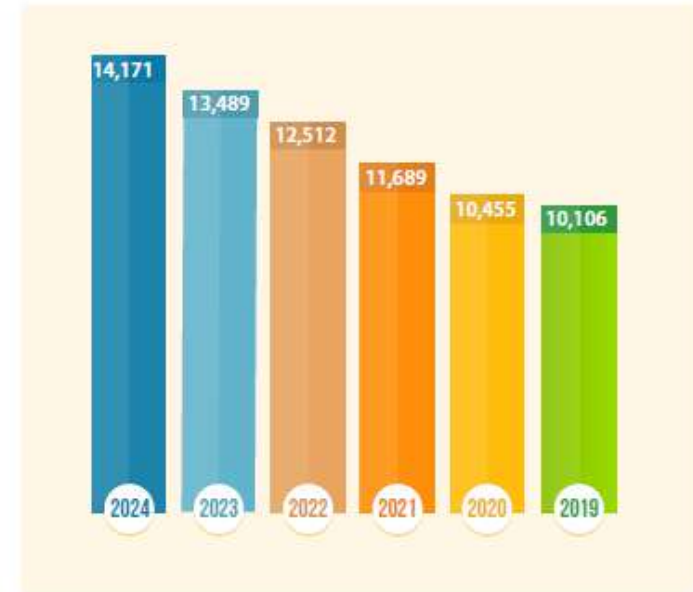
Shareholders' equity (Rs. in million)