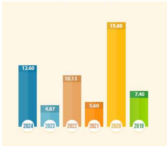
Price earning ratio (times)