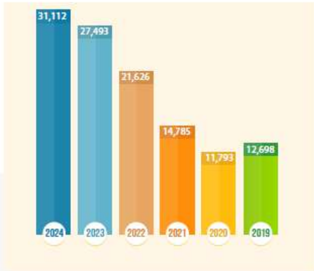
Revenue from contracts with customers - net (Rs. in million)