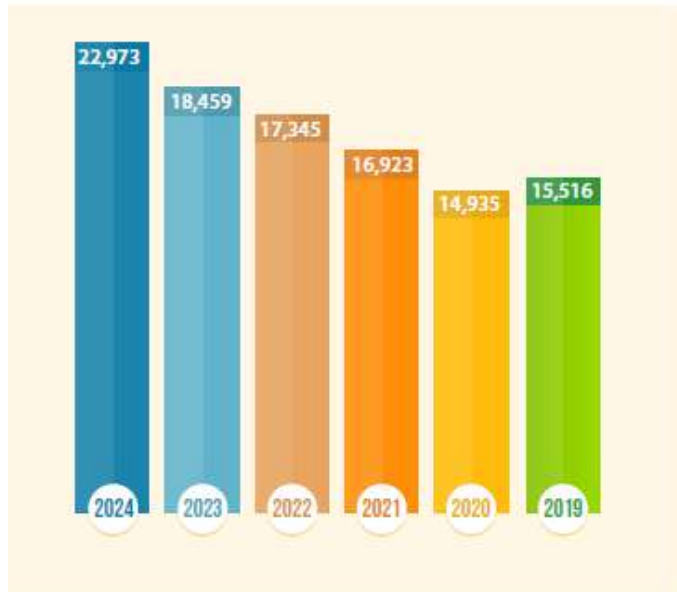
Property, plant and equipment (Rs. in million)