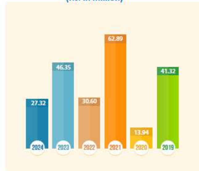
Earnings per share - Basic (Rupees)